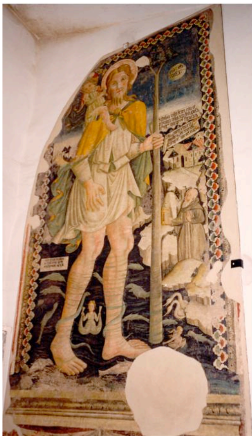
Picture 3 Paolo da Visso's fresco of St Christopher as it presently hangs in the corridors of the Cloistered Convent

THE FRESCO OF ST CHRISTOPHER BY PAOLO DA VISSO Paolo da Visso is known to have painted a number of works of art between 1435 and 1482 (Venanzangeli, 2001). Among these stand out the fresco of St Christopher ( Picture 3 & 4 ), painted in 1474 in the Church of St Liberatore in Castel Sant'Angelo on Nera, a tiny little village lying between the town of Visso and Norcia. In 1970, the fresco was removed from the church to be transferred to the premises of the cloistered convent right above the church. At the moment, it can be viewed only after receiving a special permission.