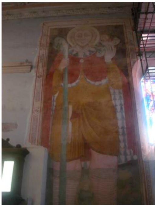
Picture 1 St Christopher in the 'Collegiata of Santa Maria in Visso'

This iconography can also be found in one of the oldest frescoes portraying Christopher that was unveiled recently ( Picture 1 & 2 ). In 1991, a gigantic fresco of St Christopher was found following some restoration work inside the 'Collegiata di S. Maria' in Visso, which had previously been concealed behind an impersonal hand of whitewash dating back to the 16 th Century plague.