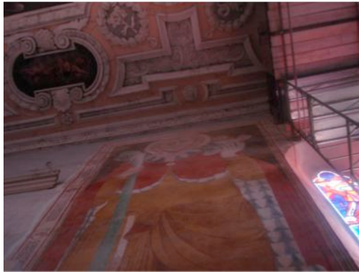
Picture 6 Close-up of the fresco of St. Christopher in the Collegiata di S. Maria in Visso

Centuries of efforts made to achieve the pureness of Tao by escaping the fascination of the flesh, refined Sufi techniques to achieve states of ecstasy, reiterated Dhikr ceremonies to perceive the Greatest, heaps of books “scientifically” extolling the value of Freudian Nirvana, all find a pictorial synthesis in the behaviour induced by Christopher’s Collegiata fresco and in the microscopic messages painted on the fresco of St Christopher by Paolo da Visso.