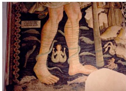
Picture 4 Detail of the Siren in the fresco of St Christopher by Paolo da Visso

The fresco dates back to the 15 th Century, a pictorial period that witnessed the flourishing of a local school of painters in Visso and in the Upper Valnerina, concomitantly to the great painting schools in the bordering Tiber Valley, which painted important religious themes with their humble local artistic skills. ( Note 4 ).