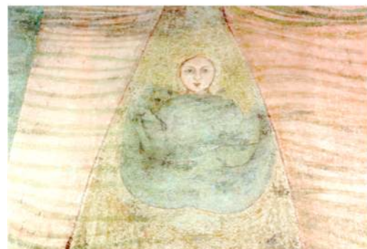
Picture 2 Detail of the siren at the feet of St Christopher in the 'Collegiata of Santa Maria in Visso'

The atypically over-sized fresco (10.68 metres high and 4.22 metres wide) painted between the two doors leading into the church is thought to be the work of an unknown 'Visso-born Artist' (Venanzangeli, 2001). The painting is simple, in the Byzantine style, without the use of perspective. In